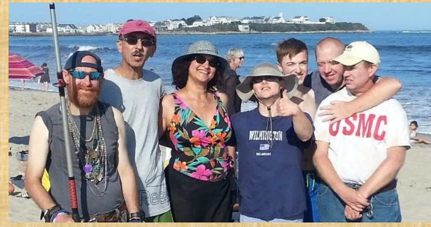
Echo Farm on a great day at the beach