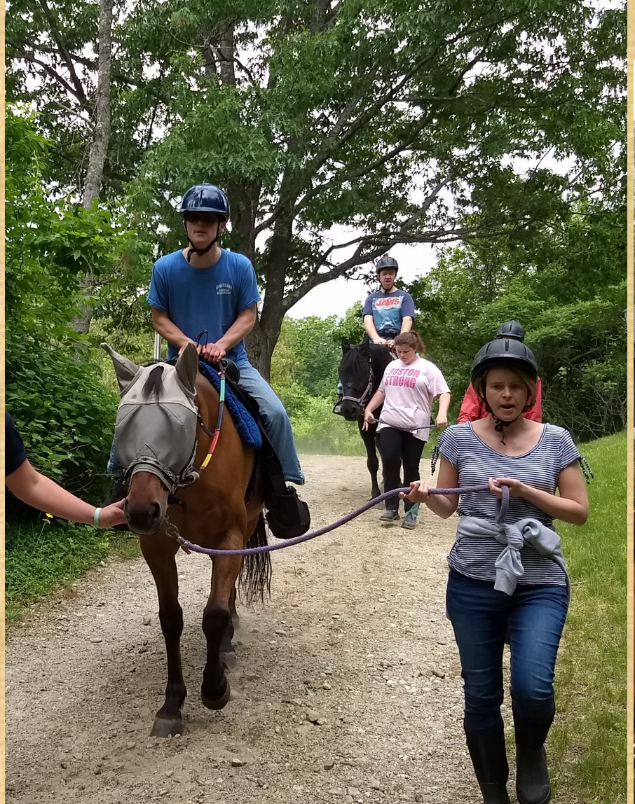
Therapeutic Riding at Touchstone Farm is a favorite.