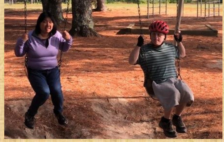
Oh, how I like to go up in a swing! (RLS)