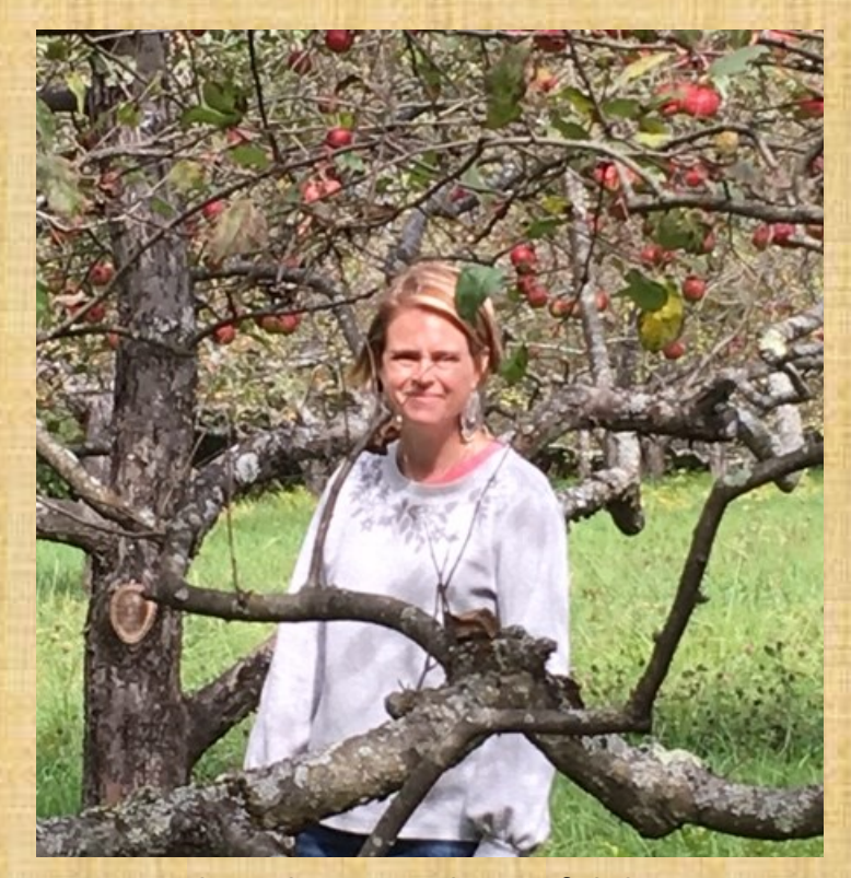
Apple picking on a beautiful day