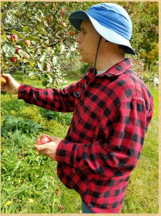
Apple picking and pizza at Orchard Hill Bakery in Alstead, NH