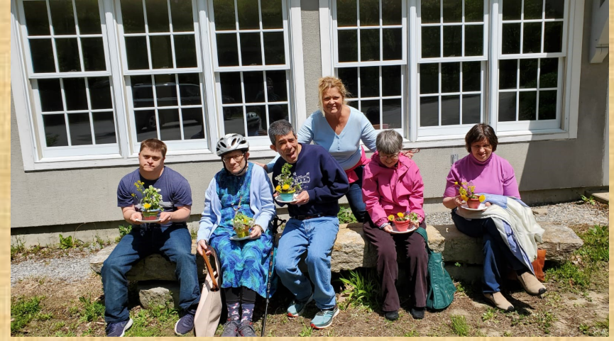
Flower arrangements for Harvest Festival tables