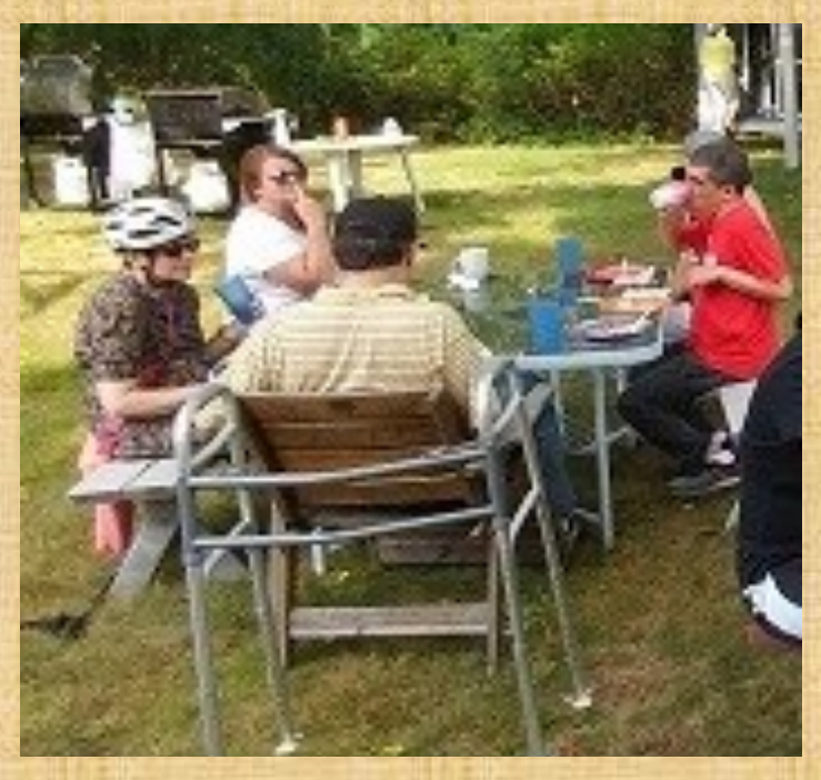
Labor Day picnic at Crossroads on a beautiful and perfect day