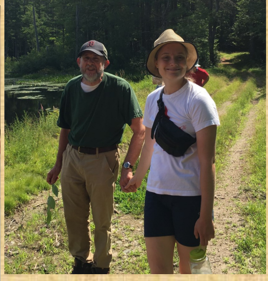
Basketball at Temple Elementary School or hiking the trails